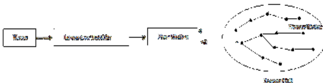
Figure 1. Structure of Wireless Sensor Network

A wireless sensor network (WSN) [1] is a wireless network, built from a few to several hundred or even thousands of nodes, where each node is connected to one or several sensors which communicate through a wireless link, as it shows in Figure 1. It consists of sensor nodes that capturing information from an environment, processing data and transmitting them to the base station or destination. These nodes are characterized by a low size, a low complexity device with low cost, which communicates through a wireless link. In addition, wireless sensor networks confront same difficulties, such as limited power supplies, low bandwidth, small memory sizes and limited energy.